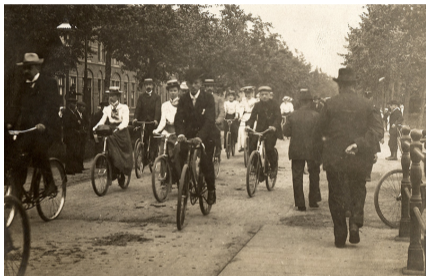
Hereweg Groningen in 1906.